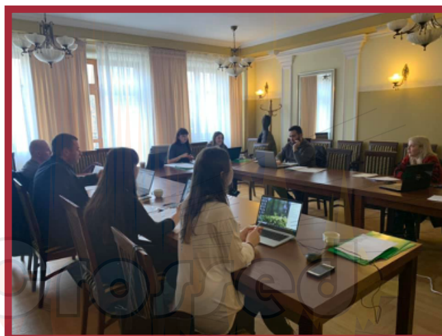
Second Transnational Meeting in Rzeszow, Poland

The 2nd transnational project meeting was held in Rzeszow, Poland on the 26th of 2020. It was coordinated by Jugend-&Kulturprojekte.V., and hosted by ACUMEN. The objectives of the meeting were to monitor the progress of the project by collecting the status of the project tasks from project partners, by reviewing them against the project plan and by reviewing the milestones achieved and to discuss the upcoming tasks regarding the development of IO2, IO3, IO4 and IO5